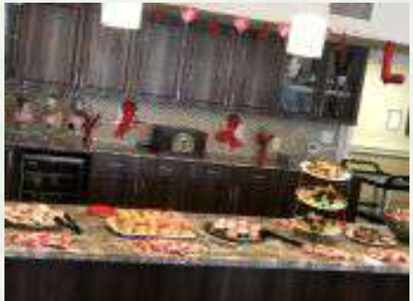
Happy Valentine's Day!